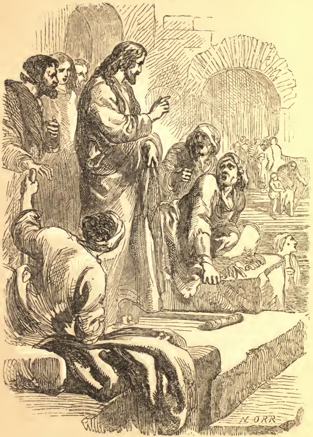
THE LAME MAN TOWLED.